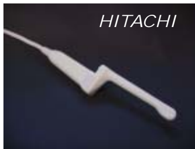
EUP-V33W Intercavity Probe 5/6.5 MHz $3500.00