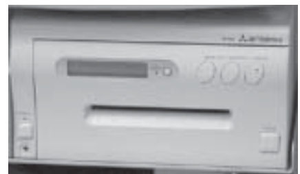
Mitsubishi CP-700 RGB & SVHS Color Printer $500.