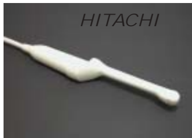
EUP-V53W Intercavity 5/6.5 MHz $3500.