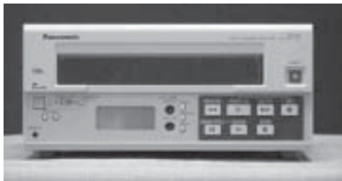
Panasonic AG-5210 VCR $ 195.