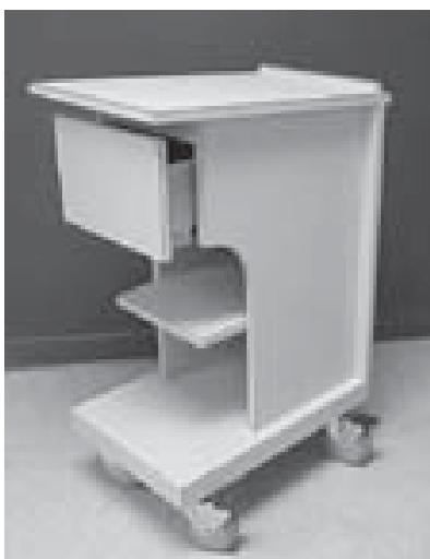
Custom Ultrasound Transport Cart Demo $795.00