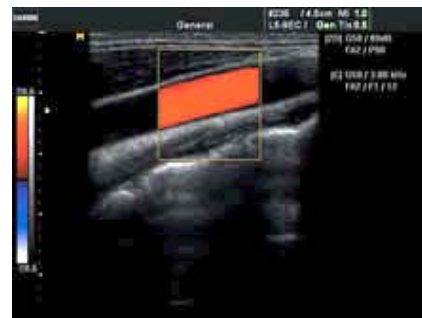
High Resolution CCA Image of the Carotid Artery

FOR INFORMATION, CONTACT: IMAGING CONCEPTS INC