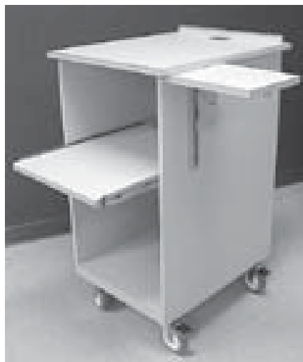
Custom Mobile Computer Cart Demo $795.00