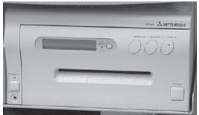
Mitsubishi CP-770DW Digital Color Video Printer Demo- $550.00