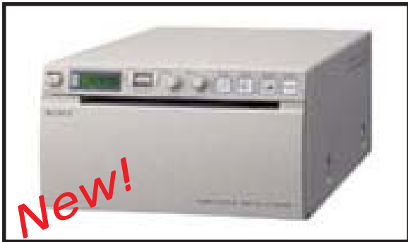
Sony UP-897MD Thermal Video Printer $895.00