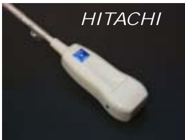
EUP-SD300A Phased 2.5 MHz $900.