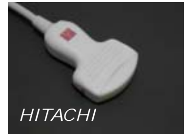
EUP-C516 60R Abd Probe 2-5 MHz $2950.