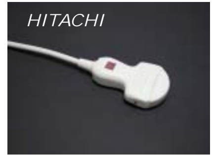
EUP-C314T Abd Probe 3.5/2.5 MHz $2550.