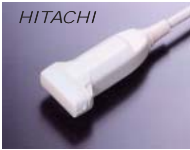
EUP-L33ST or EUP-L53S Linear Sm Parts & Vasc Probe 7.5/5 MHz $3350.

All Transducers sold on a "First Come, First Serve basis".