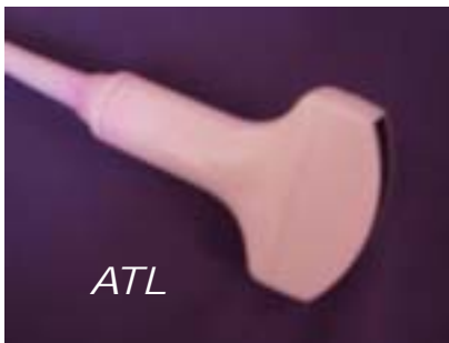
ATL UM400C Abdominal Probe 3.5MHz $1500.