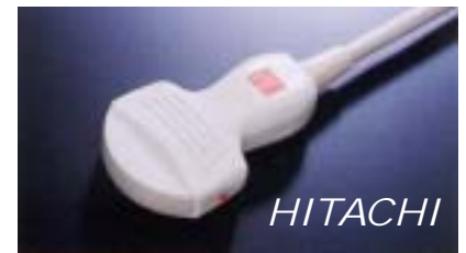
EUP-C314G Abd Probe 2-5 MHz $2550.