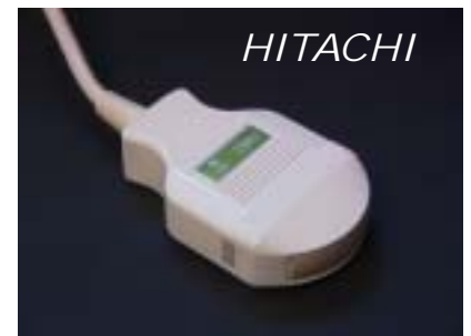
EUP-C324 or C314 Abd Probe 5/3.5 or 3.5 MHz $1500.

We carry an extensive line of transducers, for models not listed, call us at 800-228-0060.