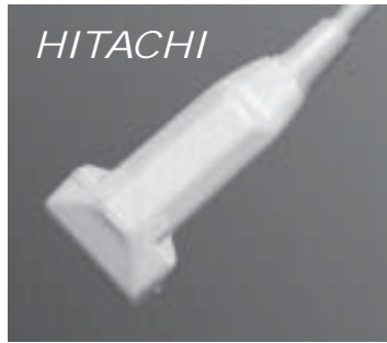
EUP-L33S Linear Probe 7.5/5 MHz $3350.