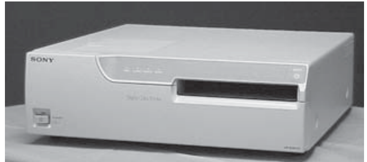
Sony UPD-2500 Digital Color Printer $250.00