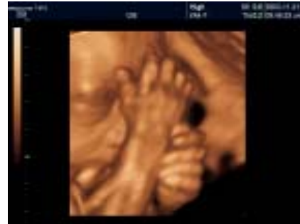
3D & 4D Imaging with the Abdominal 3D/4D Probe