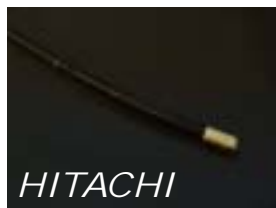
EUP-ES322 BiPlane TEE Probe $900.

We carry an extensive line of transducers, for models not listed, call us at 800-228-0060.