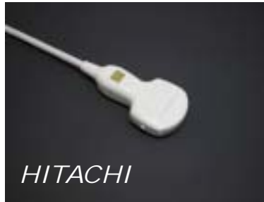
EUP-C524 Abd Probe 3-7 MHz $2950.