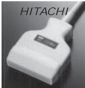
EUP-L33 Linear Probe 7.5 MHz $1500.