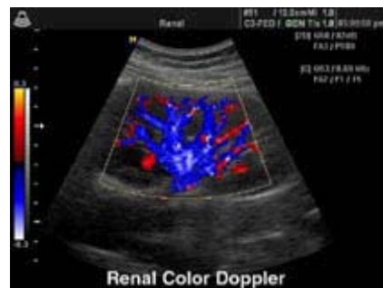
Renal Colorflow Imaging