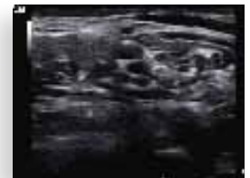
Brachial Plexus – Interscalene