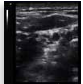
Brachial Plexus – Supraclavicular