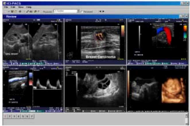
Image Data is displayed conveniently in a 6 on 1 window or can be displayed 4 on 1, or 9 on 1 for clinician review. All Image Data is stored uncompressed for Maximum Image Resolution.